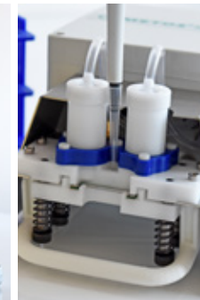
3. Inject the sample into iMETOS MobiLab.

This technology also works for on-site measurements in field conditions and can be operated by users without prior laboratory knowledge . The measured data is related to GPS coordinates (using a mobile app) and sent to our web-cloud FieldClimate, where it is safely stored and accessible for the user.