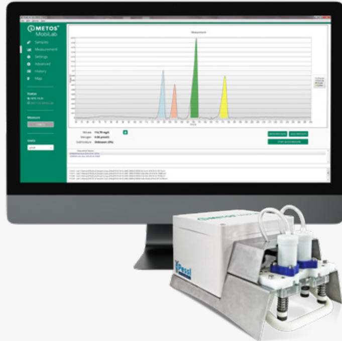
Photo: Results of soil sample analysis shown as a graph in iMETOS MobiLab application.