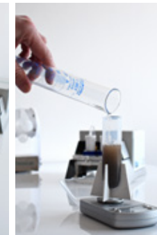
2. Add the extraction buffer to the soil.