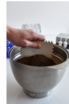
1. Sieve the soil.

The filtered sample is injected into a microfluidic capillary where a strong electric field is applied . All important nutrients are in fact electrically charged molecules, and therefore react to the electrical field. They are separated in the chip according to their chemical nature and finally measured by a detector at the end of the capillary.